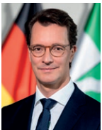
Hendrik Wüst Minister President of the State of North Rhine-Westphalia

North Rhine-Westphalia and the United States have been linked by a deep friendship and partnership for decades. We are expanding this further with the NRW-USA Year 2023/2024. Within the scope of this transatlantic friendship, lawyers from our state will also study in the USA and gain further qualifications there. The „DAJV LL.M. Day“ organized by the German-American Lawyers Association have been preparing them for this for many years. I would like to sincerely thank everyone involved in this scheme. This year, the „DAJV LL.M. Days“ will once again take place in Cologne, the largest city in North Rhine-Westphalia! You can look forward to many exciting encounters, a valuable exchange of ideas and lots of information about the possibilities of studying for a „Master of Laws“ in the United States.